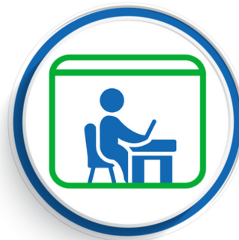
Public Space Improvements