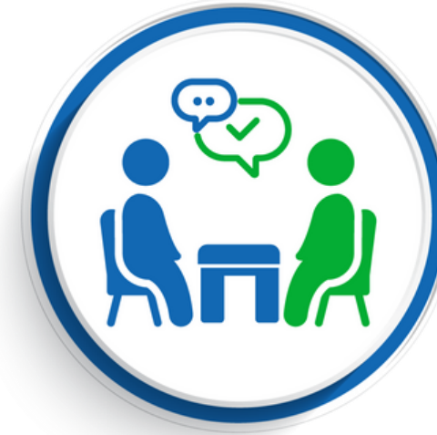
Digital Navigation/ Tenant Coordination