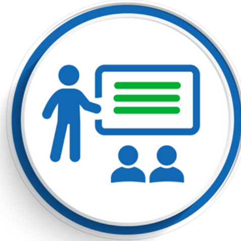
Digital Literacy and Education