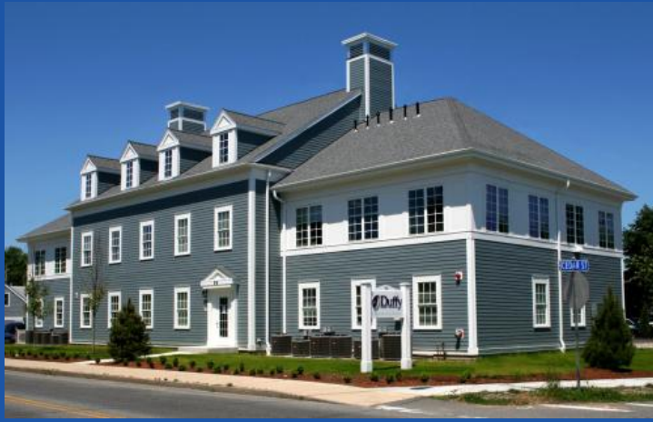
Duffy Health Center in Hyannis, MA.

In 2023, the Massachusetts League of Community Health Centers (Mass League) joined MBI's (MBI) Digital Equity Partnerships program. Through this $3.75 million investment, Mass League connected with its subgrantee Duffy Health Center (Duffy), a community-based provider of primary care, mental health and psychiatry services in Hyannis.