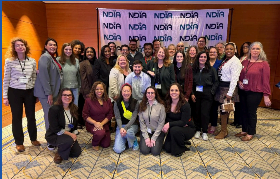
Photo of the MBI team with fellow Net Inclusion Conference members from Massachusetts.

Members of the MBI team were in attendance at the 2026 National Digital Inclusion Alliance's (NDIA) Net Inclusion Conference in Chicago. Team members attended listening sessions, panels and workshops from national leaders on topics including AI, community engagement, digital skills training, device access and more.