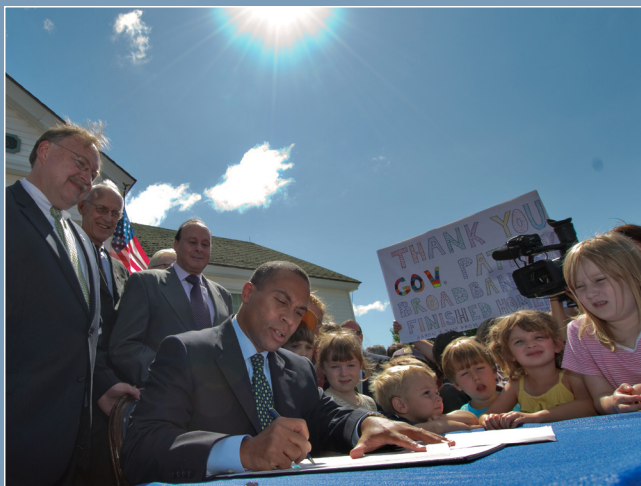
Governor Patrick signs the Broadband Bill in 2008, Goshen, MA.