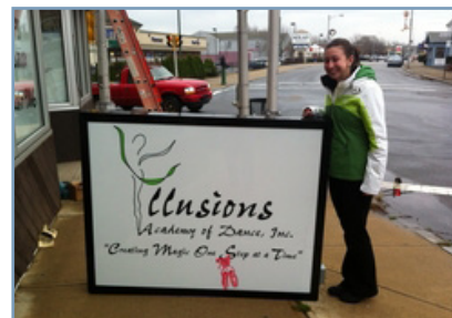
Illusions Academy of Dance, New Bedford, MA